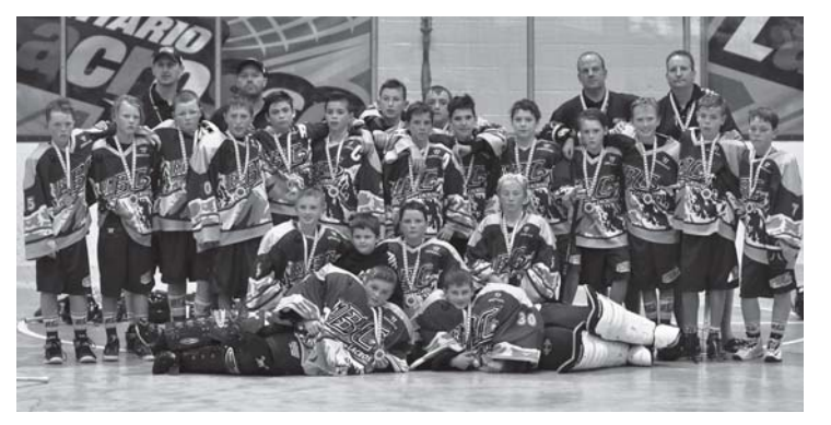
2015 Team BC Pee Wee Boys Team - Silver

This past summer, six Team BC Box Lacrosse teams competed in three provinces at the 2015 Youth National Box Lacrosse Championships. The Bantam boys Nationals were held July 21-25 in Saskatoon, Saskatchewan, while the Pee Wee and Midget boys Nationals were August 2-8, in Whitby, Ontario alongside the OLA Lacrosse Festival..